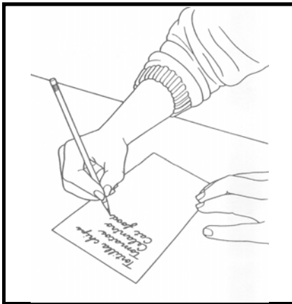
Make a shopping list with a pencil.

You indicated that you have some restrictions with tasks such as those shown below. Let us know if we do not seem to be adequately addressing problems such as these, or if you have recently experienced difficulty in these areas. Most importantly, let us know if you are experiencing difficulty with other tasks that you regularly perform at work or home. We want to do everything we can to help you improve your physical abilities.